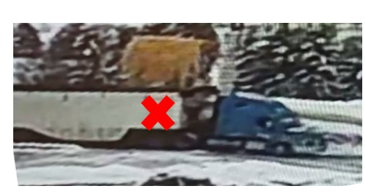
Truck driver still inside trailer while loader dumps half of a bucket.