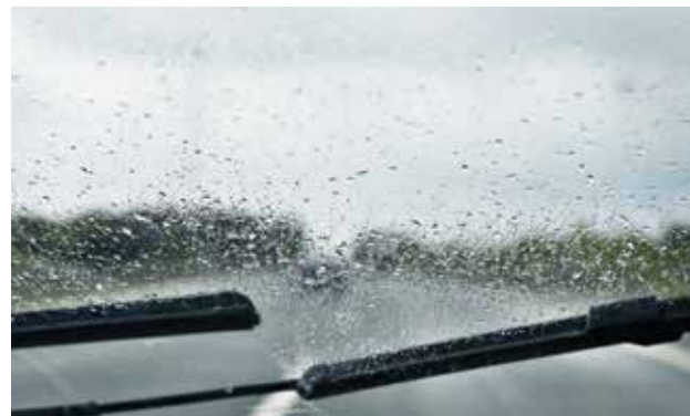
To this...in a matter of seconds.