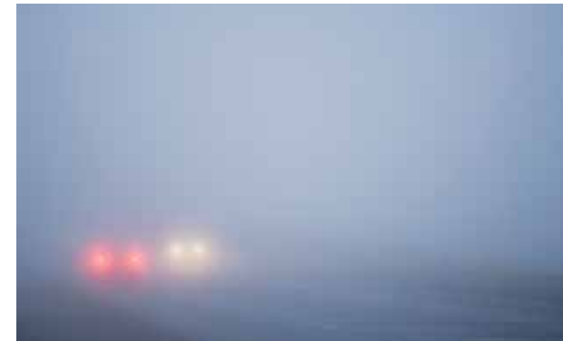
Are you driving fast or slow? In fog you never know. Slow down.