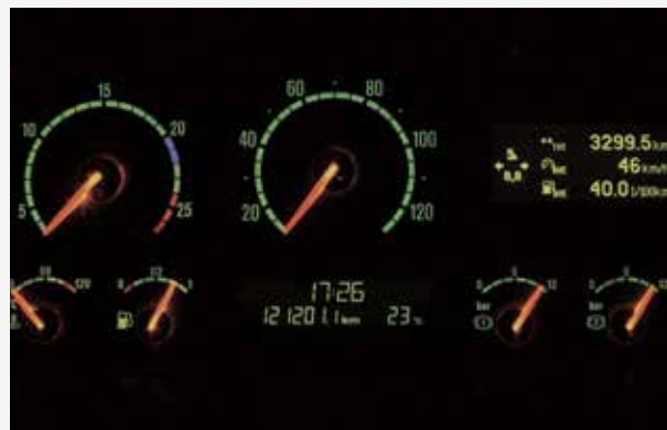
Adjust dashboard lights to give your eyes a break.