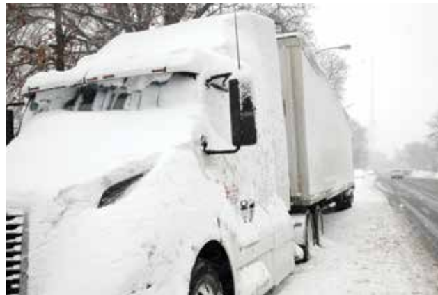
Sweep snow from every part of your vehicle.